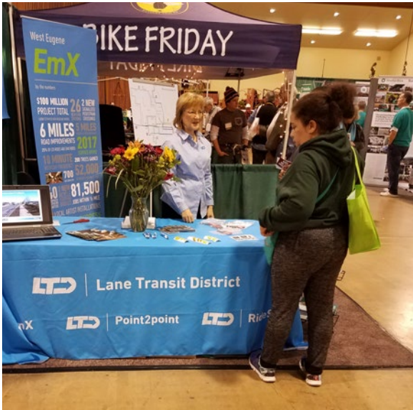
LTD at Eugene's Good Earth Home, Garden and Living Show

In the past several weeks, LTD has been out and about in the community. We attended the annual Martin Luther King Jr. rally and helped move marchers to Springfield's afternoon event and back to PK Park, where the rally and march began. LTD also provided transportation to hundreds of marchers for the January 21, "Women's March" through downtown Eugene, putting extra buses into service as the crowds swelled. We visited with many area residents at Eugene's Good Earth Home, Garden and Living Show in January, answering questions and providing information to riders, prospective transit users and the general public. LTD will continue to be out and about over the next several months providing information to, and taking comments from our riders and community members on the proposed service enhancements coming this September when the West Eugene EmX line begins service.