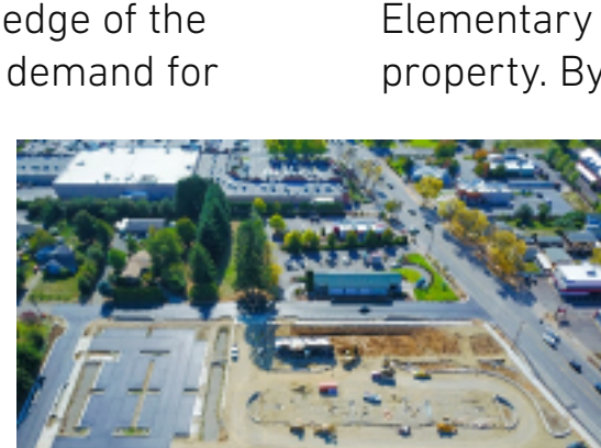
October 9, 2020

As early as 2005, LTD recognized the River Road and Santa Clara communities were due for additional transit investment. In 1982, LTD had invested in the then-new River Road transit station at what was the edge of the urban area at the time, to serve a growing demand for transportation needs in northwest Eugene. As the community grew, it became clear that a greater transit service was needed north of the station and Beltline Highway in the Santa Clara neighborhood. In 2015, LTD purchased an 8-acre undeveloped parcel along River Road between Hunsaker Lane and Green Lane to pursue the design and construction of the Santa Clara Transit Station.